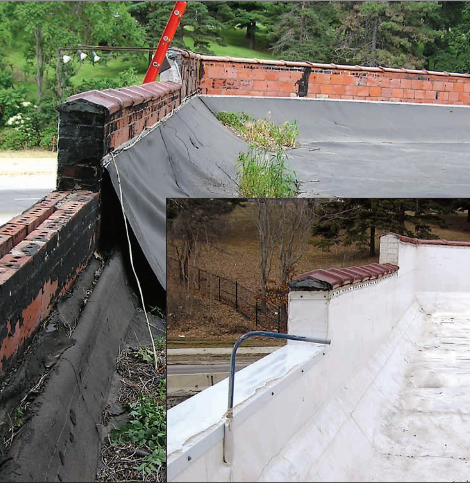
▲ Wall flashings