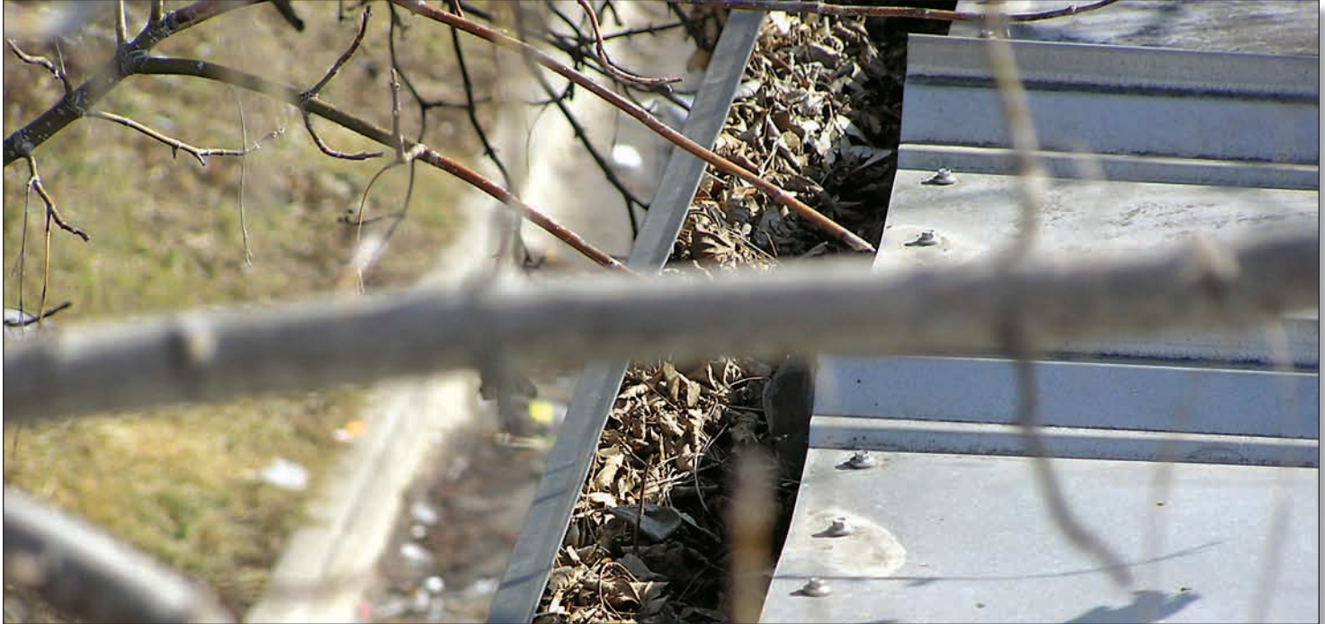
▲ Blocked gutters