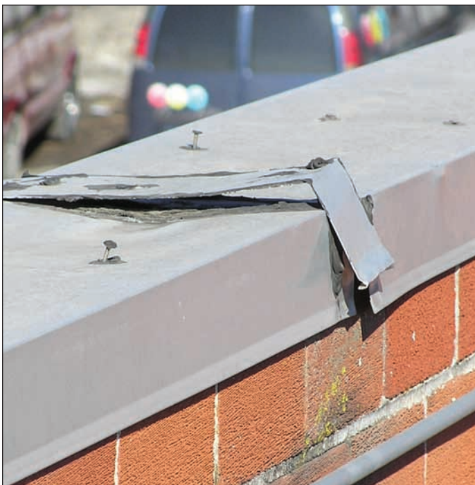
▲ Metal coping caps