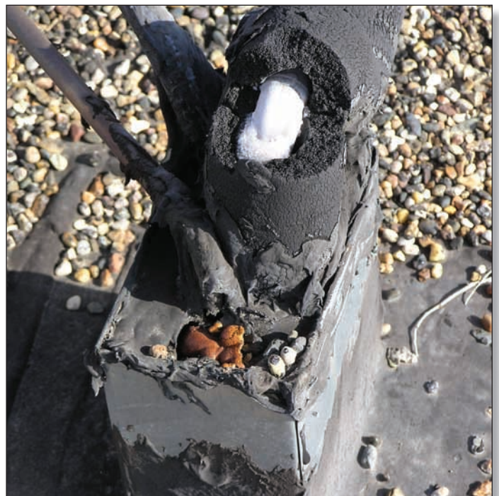
▲ Pitch pans