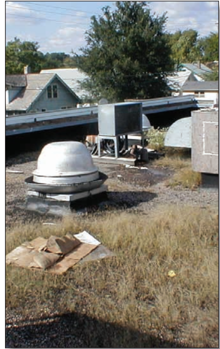
▲ Roof top cleanliness