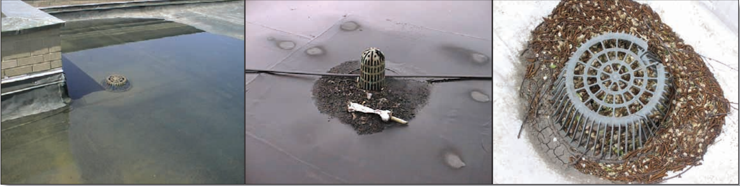
▲ Blocked drains